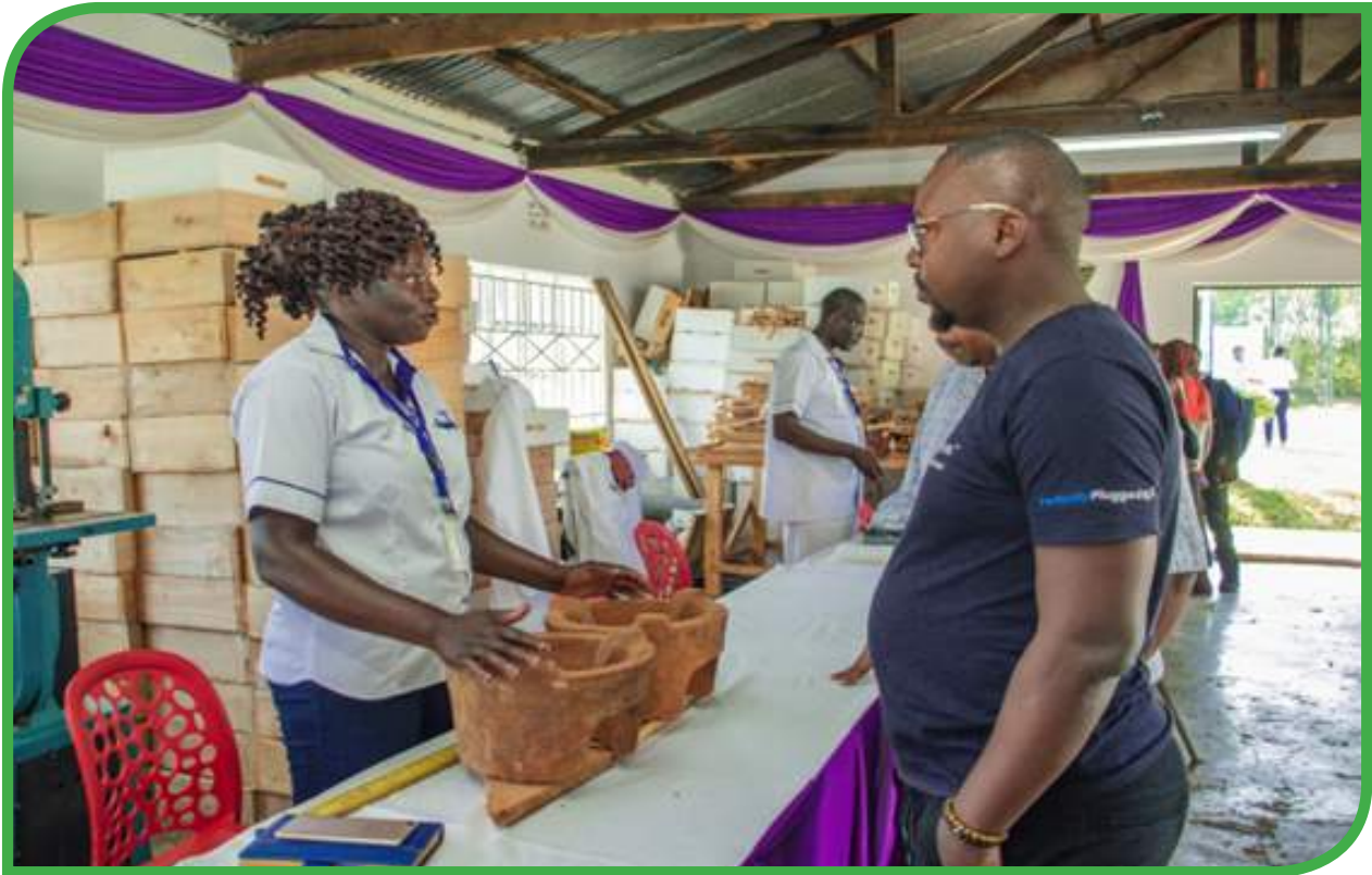
CISS showcasing energy saving cooking stoves