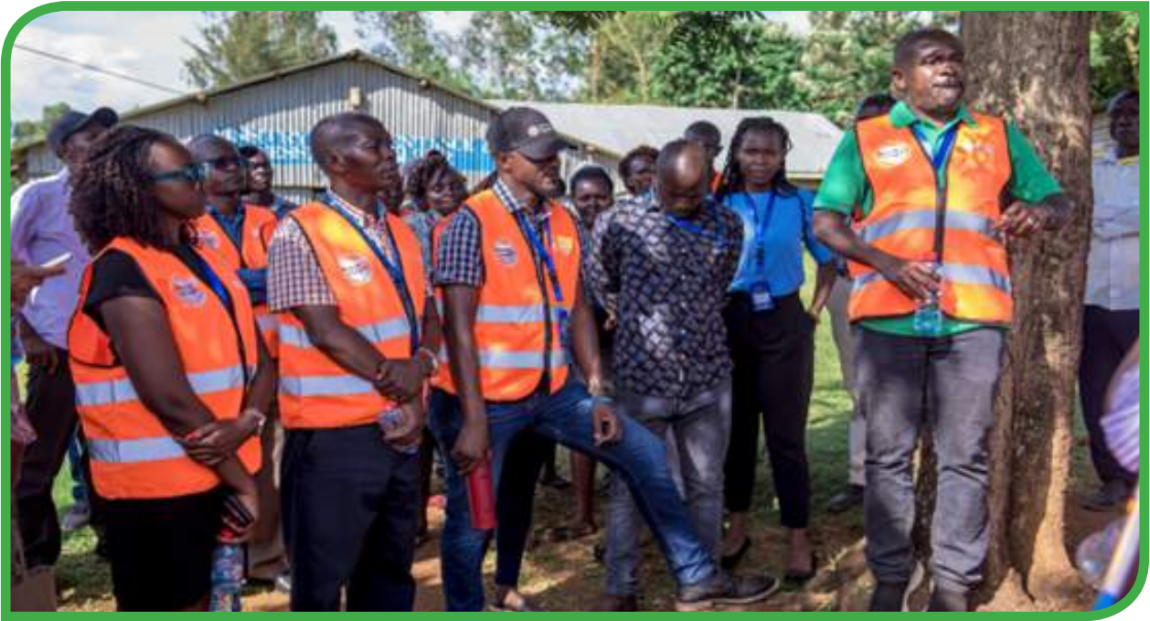
Participants being taken through the process of deploying a Hot Spot In Akala, Gem Sub-County.

The Summit brought together various stakeholders from government, civil society academia, private sector and the digital value chain contributing to great conversations and networking for partnerships.