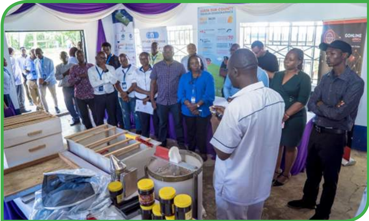
CISS Showcasing Fosema Project Interventions In Apiculture (Bee Keeping)